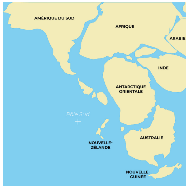
Gondwana about 150 million years ago: fragments of West Antarctica are uncertain.

The history of the Antarctic Ocean is inseparable from that of the continent. Gondwana began to fracture under the effect of intense volcanic activity about 170 million years ago, when the Earth was experiencing a hot and humid period. Several tens of millions of years later, Madagascar and the Seychelles broke away from Africa, as well as India, which began its spectacular ascent northwards, where it would become embedded in China, creating the Himalayas (a phenomenon that still continues today). The crack that opened 125 million years ago between South America and Africa will gradually become the Atlantic Ocean (with its submerged ridge). The Antarctic-Australia couple is still united some 70M.A. ago, but still has a subtropical climate. Finally, around 55 million years ago, a new branch of the Indian ridge (Eastern branch) isolates Australia which "goes up" to close the Timor Passage, cutting off the old water mass exchanges with the Pacific. When the Drake Passage finally opens, the powerful circum-Antarctic oceanic circulation starts its current and, about 41 million years ago, the southern glaciers are transformed into an ice cap (lava that erupted some 20 million years ago is characteristic of sub-glacial eruptions, proving that the cap existed at that time). From then on, the bases of oceanic and atmospheric circulations are in place for the birth of the terrestrial climates that we know today.